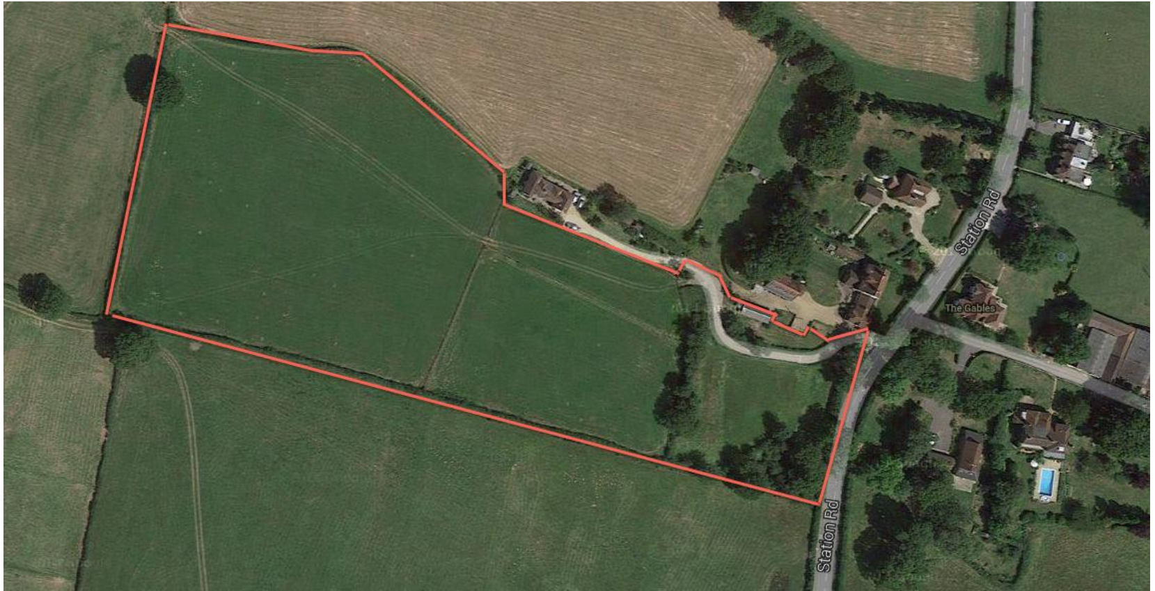
INHOLMES FARM LAND NORTH OF PLUMPTON VILLAGE